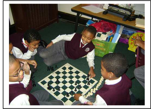
Cambridge students enjoying a game of chess during Ambassadors Club.

Mandatory Parent Meeting Thursday, January 14, 2010