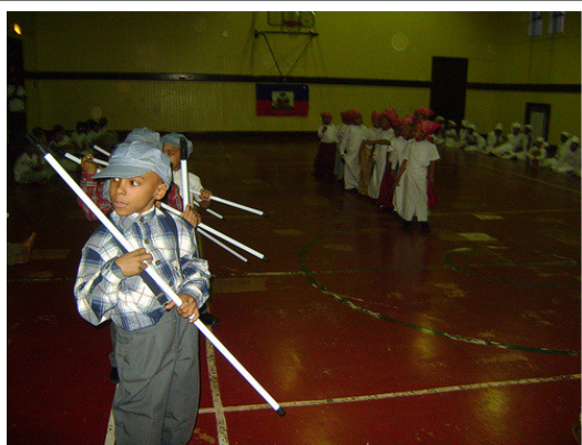
Primary Classes performing a railroad scene at the Cambridge Black History Program!

Come and be part of our celebration and adoration of God through worship.